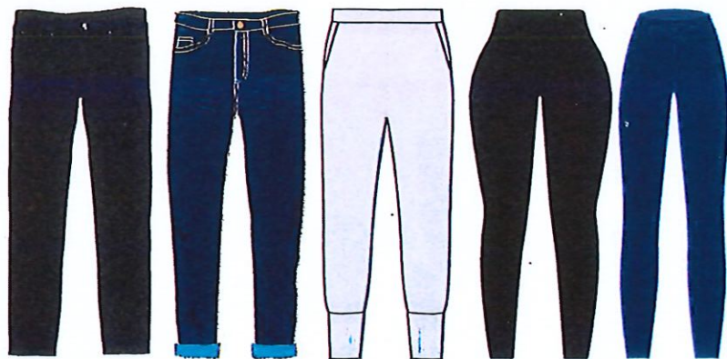
Black/Blue Denim, jogger/sweatpants, leggings, jeggings