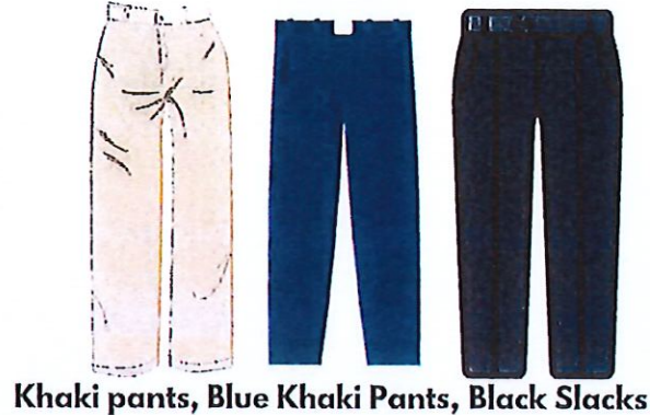
Khaki pants, Blue Khaki Pants, Black Slacks